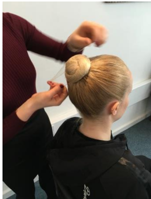
6. Cover bun with hair net (hair nets are better than bun nets)