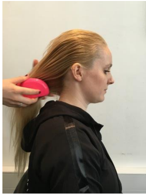
1. Brush hair