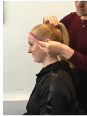
3. Smooth hair over with comb and hairspray