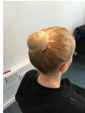
8. Secure bun with bun pins