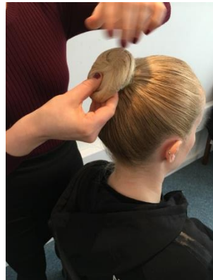
7. Flatten and shape bun