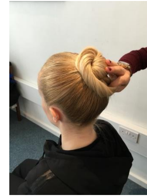
4. Twist and coil hair around hairband