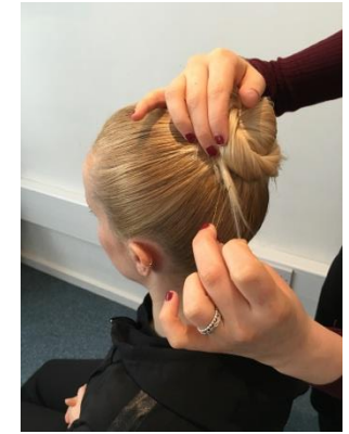
5. Place one bun pin in to secure the bun