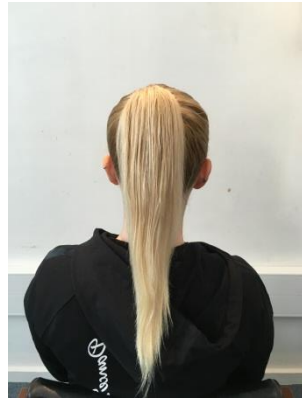
2. Gather in a high ponytail