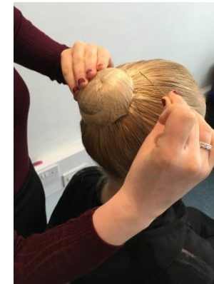
9. Secure any stray strands with bobby pins and spray